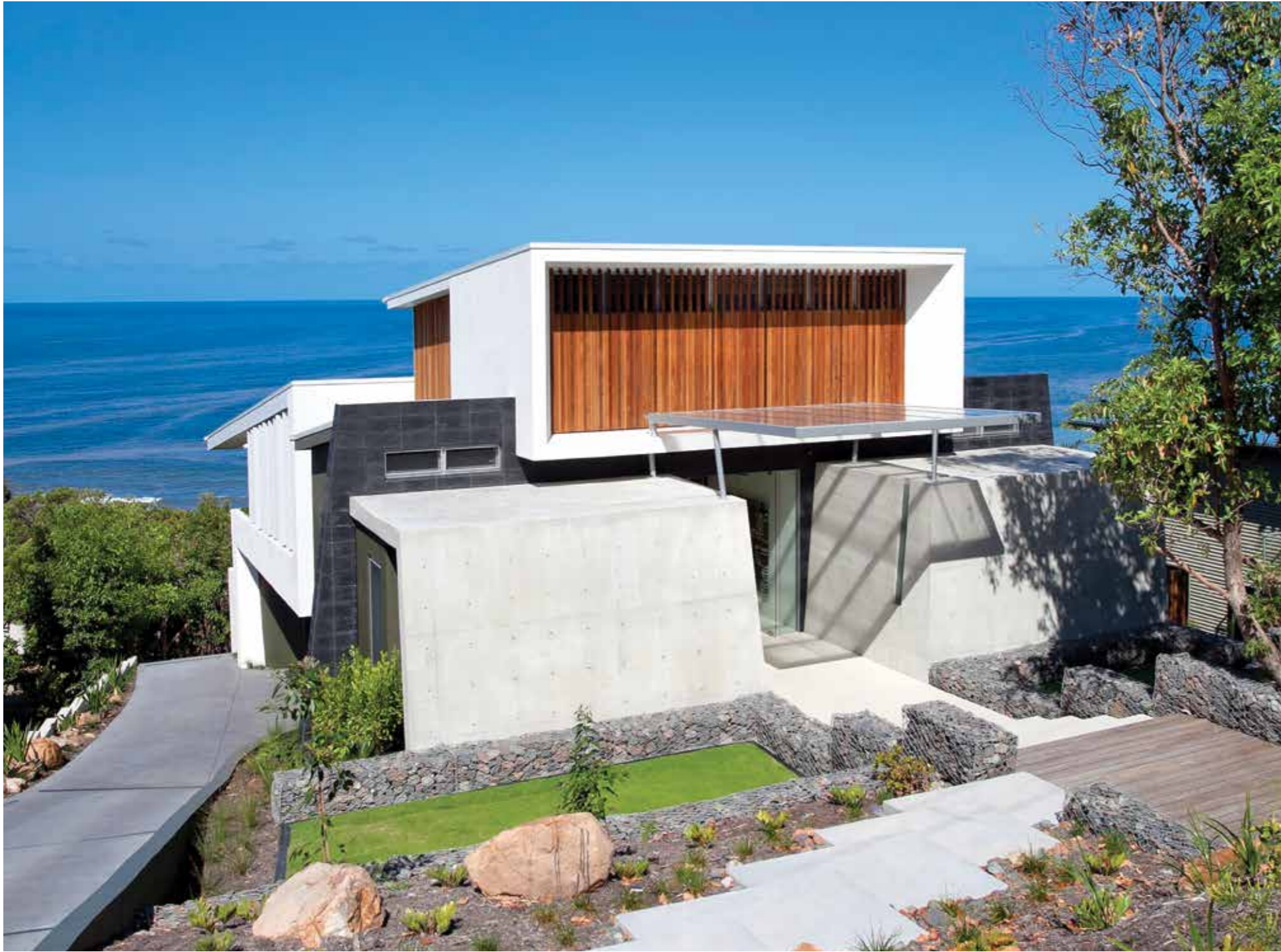
OCEANFRONT Coolum Beach