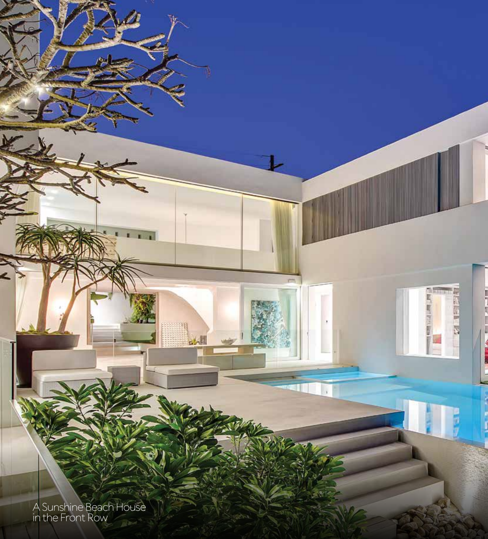
A Sunshine Beach House in the Front Row