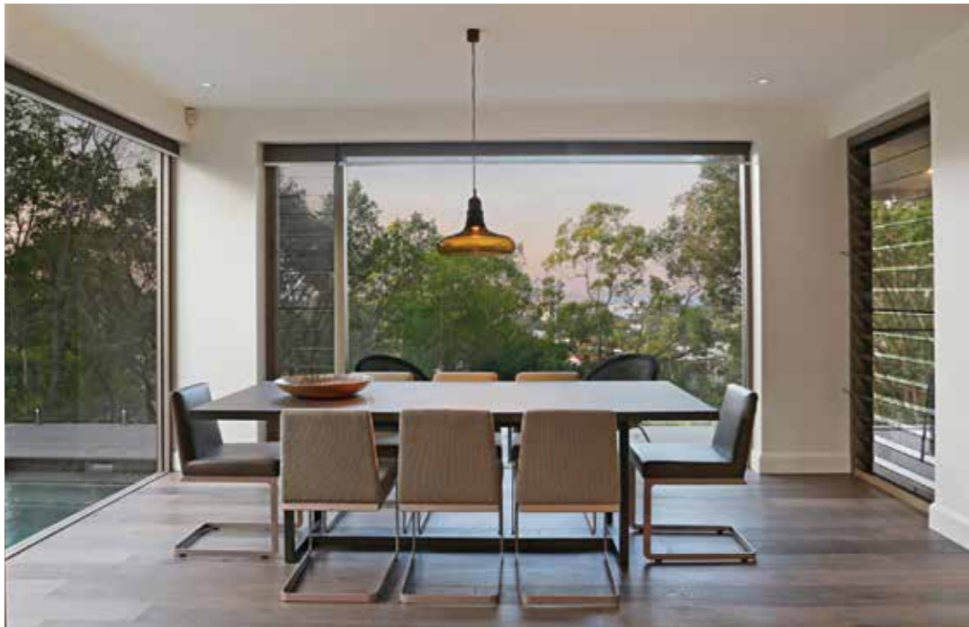
WATERSIDE Noosa Heads