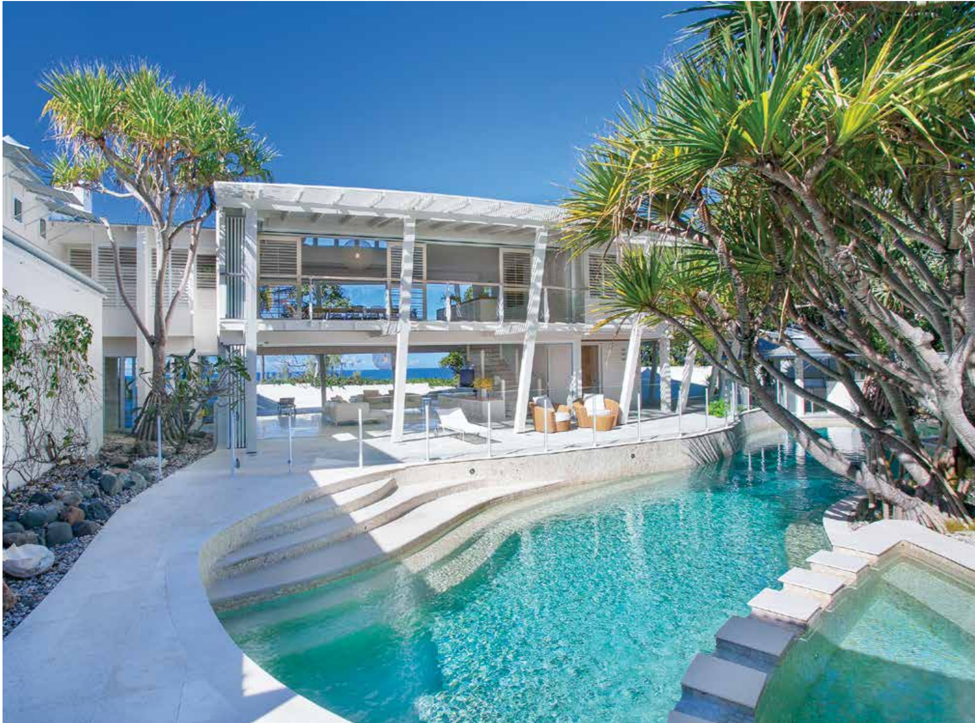
ABSOLUTE BEACHFRONT Sunshine Beach