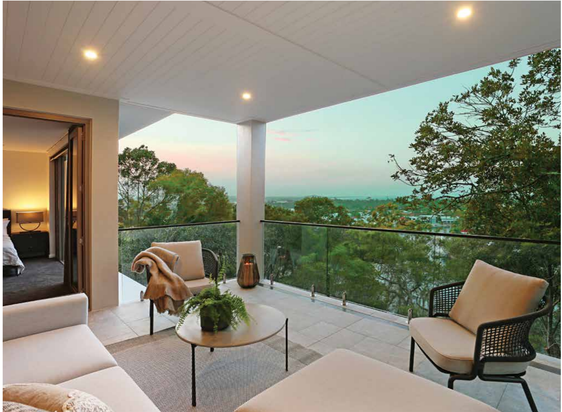
Imagine a home site with a beguiling northerly aspect and filtered water views, hovering over the natural beauty of Laguna Bay and Noosa River, with a meandering pathway amongst the flora to the sandy shore of the Noosa Sound waterways.