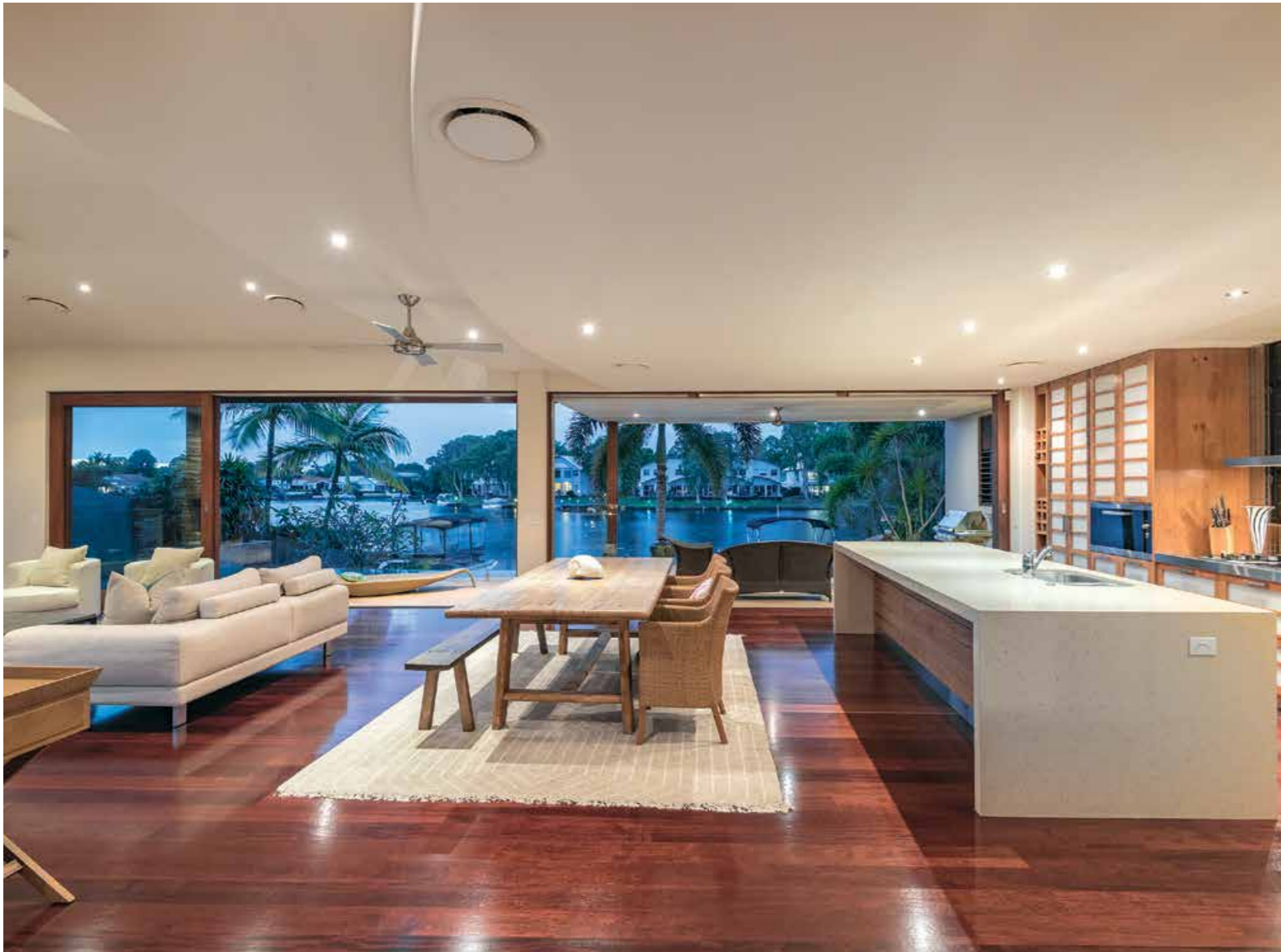
ABSOLUTE WATERFRONT Noosa Waters