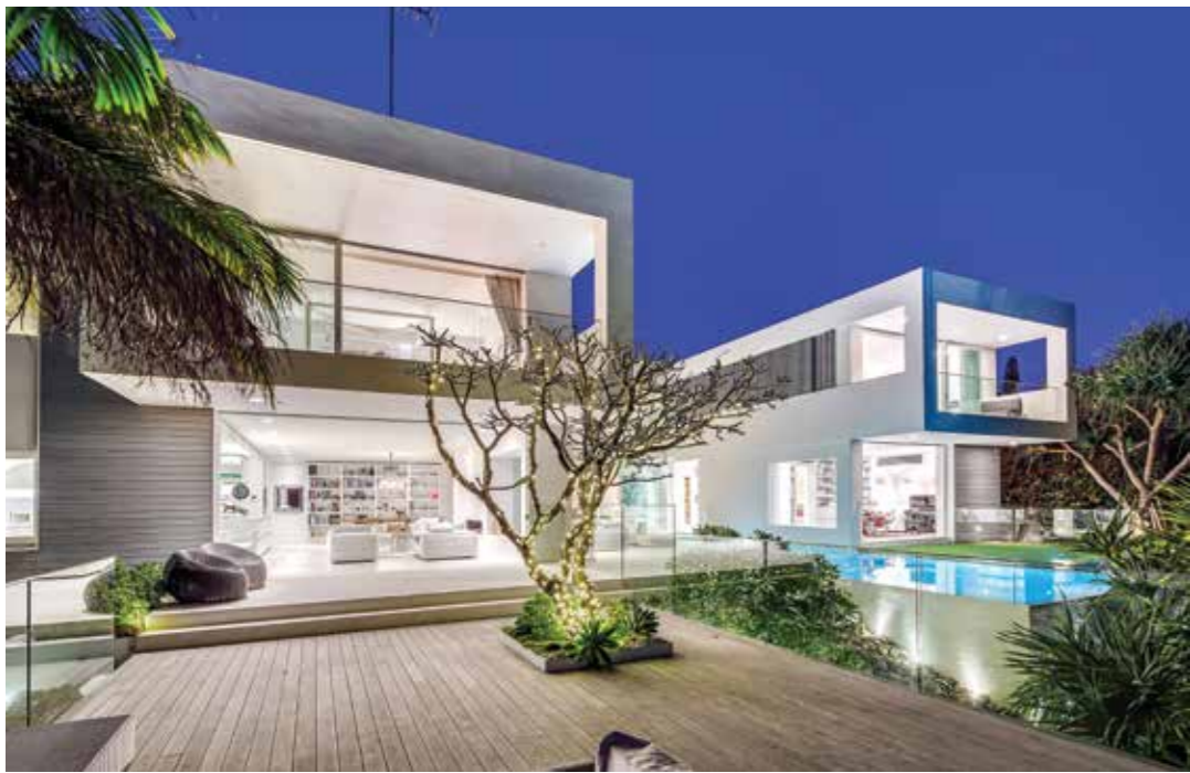
BEACHFRONT Sunshine Beach