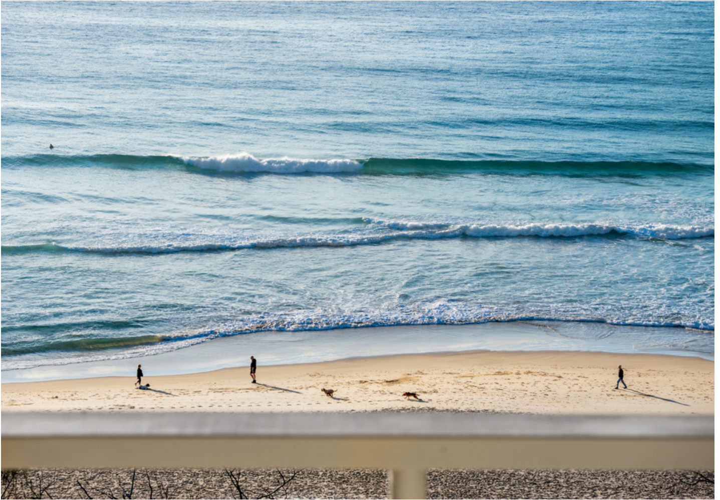
The $10m+ view that sold 62 Seaview Terrace, Sunshine Beach on auction day