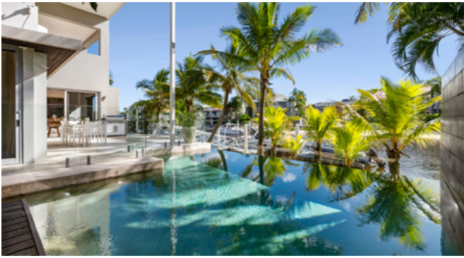
HOUSE 4 4 3 | 18 Cooran Court, Noosa Heads Purchased $7.45M