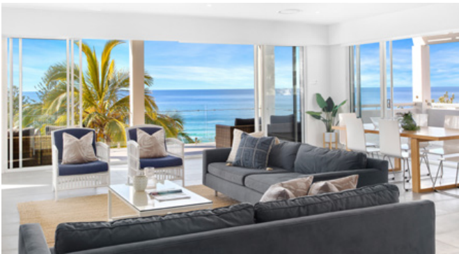
APARTMENT 3 3 2 | 5/20 Henderson Street, Sunshine Beach Purchased $4.65M