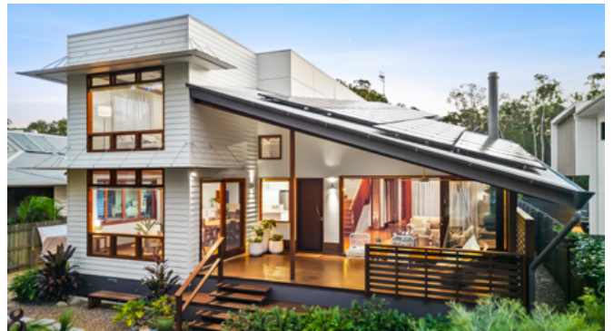
HOUSE 4 3 2 | 175 Lake Weyba Drive, Noosaville Purchased $3.4M