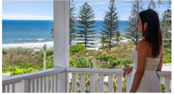
HOUSE 3 3 2 | 18 Pelican Street, Peregain Beach Purchased $3.25M