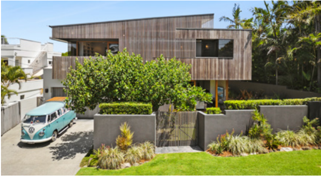
HOUSE 5 3 2 | 10 Ross Crescent, Sunshine Beach Purchased $4.35M