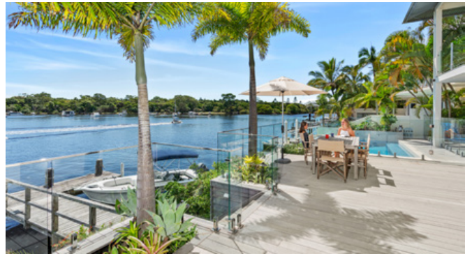
HOUSE 5 4 2 | 40 Noosa Parade, Noosa Heads Undisclosed